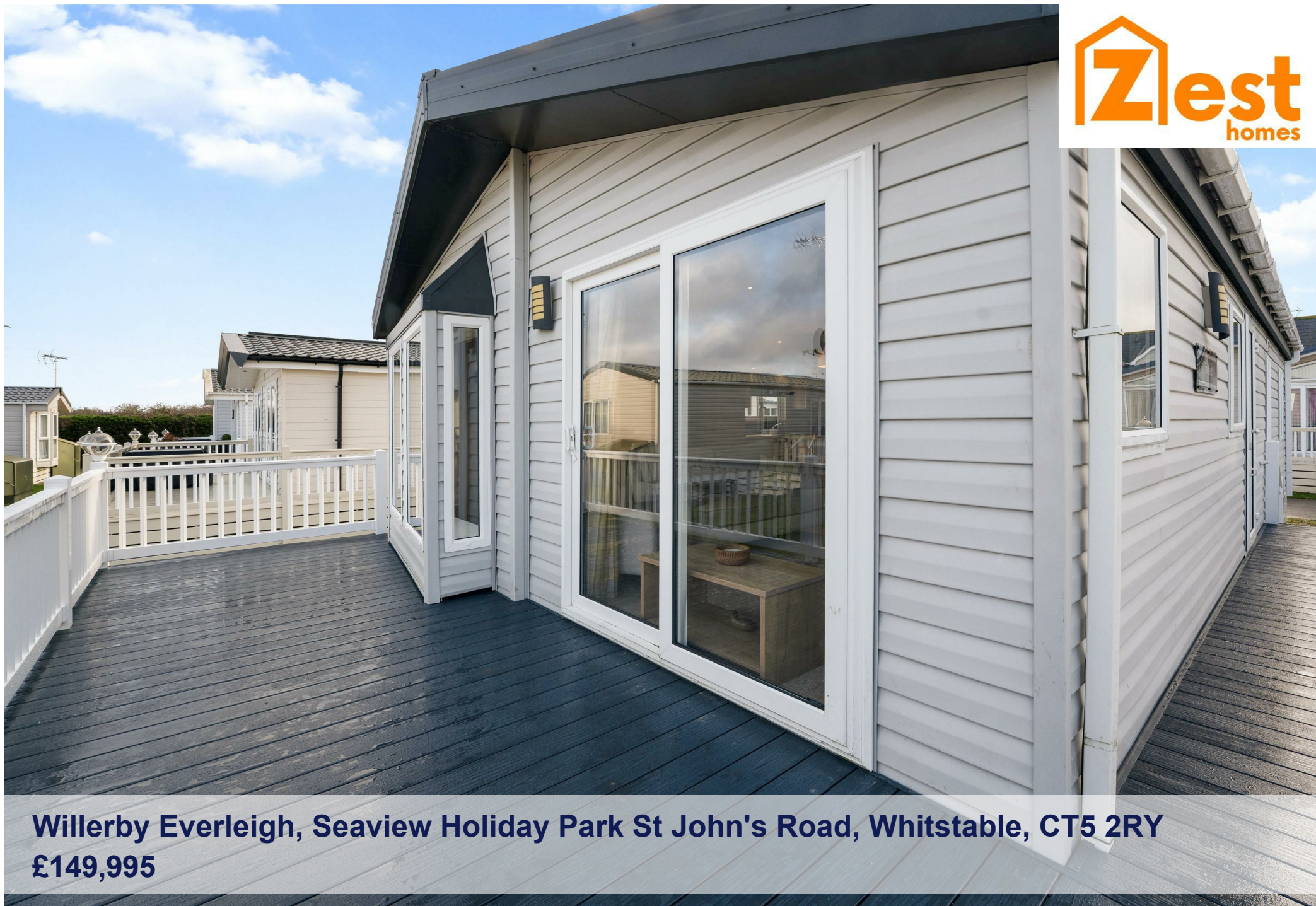
Willerby Everleigh, Seaview Holiday Park St John's Road, Whitstable, CT5 2RY £149,995